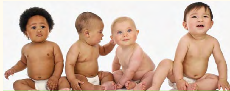
Michigan's Infant Mortality Reduction Plan